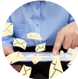
Legal Defence - CASL

How DAS business and other commercial liability policies respond